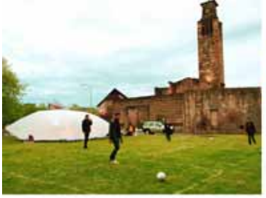
Figure 3: Outer view of the inflatable cinema (top image) and inner view of the cinematic space at MOBILELAND© garden (bottom image)